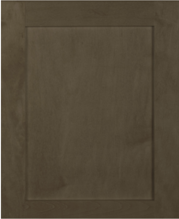
WOODMONT MONTANA SMOLDER

2,593 SQ.FT. 4 BEDROOMS 3.5 BATHS 2-CAR GARAGE