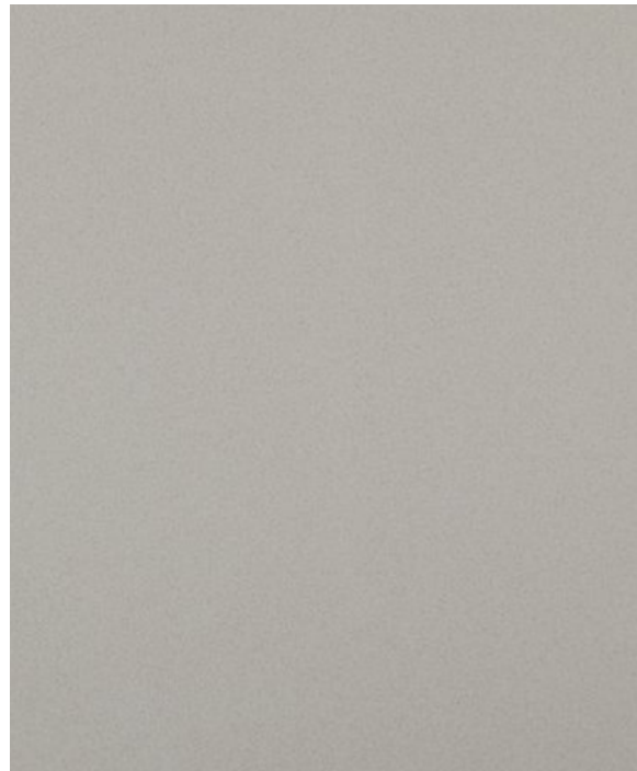
KITCHEN COUNTERTOPS: QUARTZ DUSK