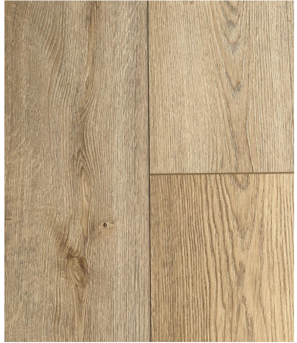
PARADIGM CONQUEST 12 X 24 TILE